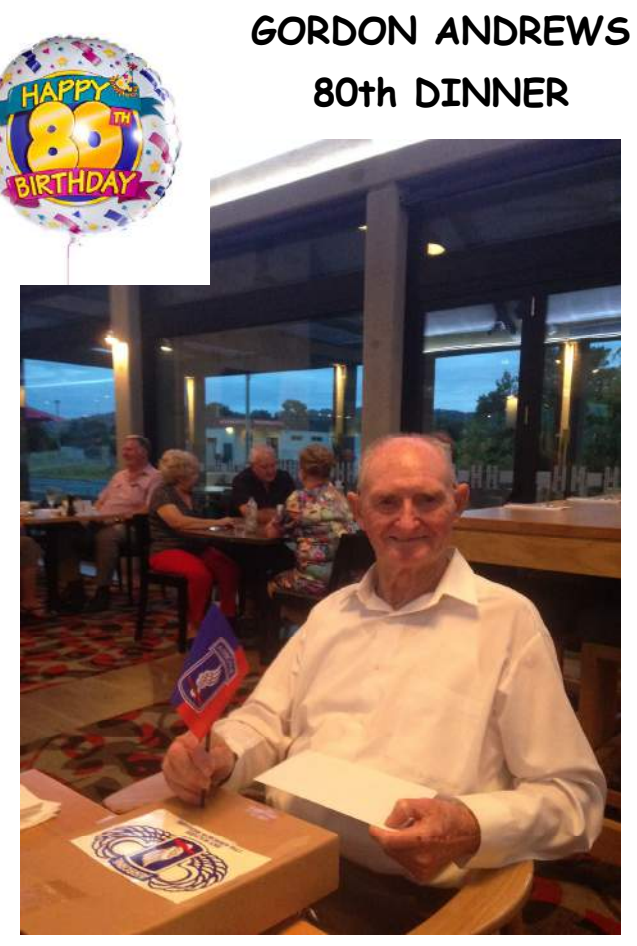
That's a satisfied look from a job well done.