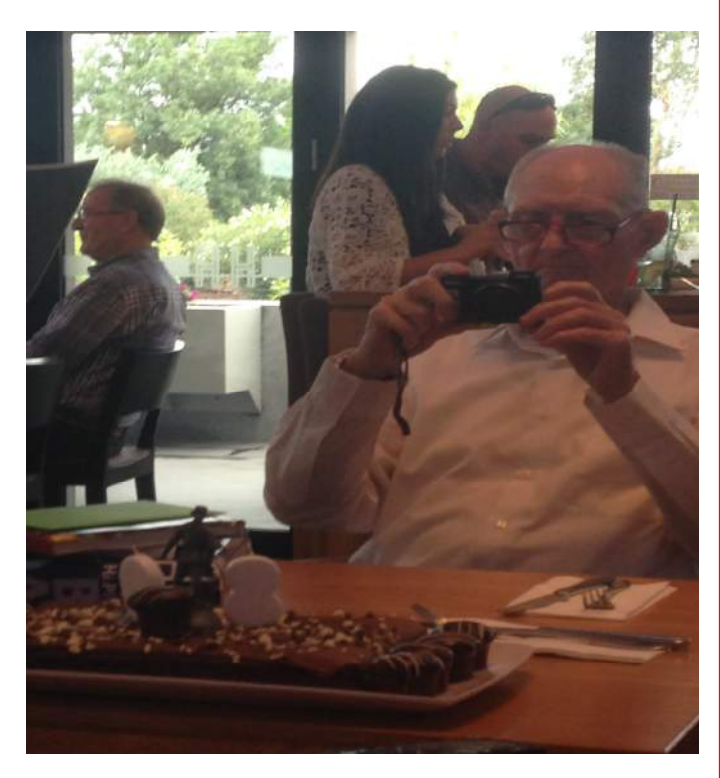
"Better get a photo of this cake before them hungry gutted ones eat it all".