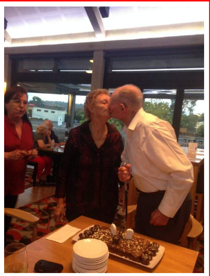
A birthday kiss from his best girl.